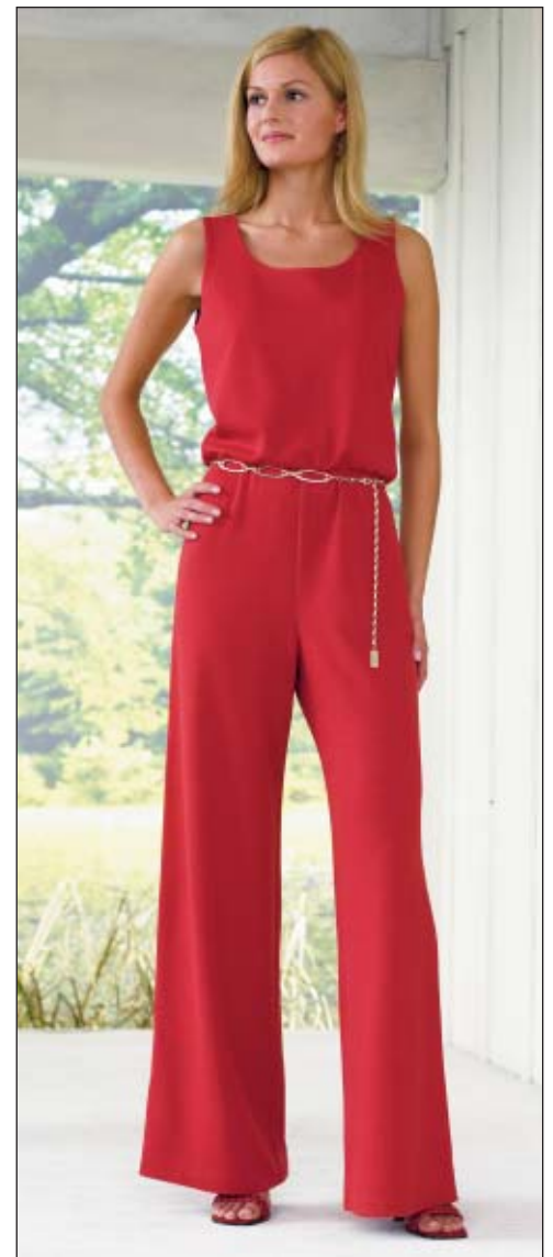
Misses' close-fitting jumpsuits have wide straight legs, waist seam with elastic, and self-fabric single layer belt. Neckline and armholes are finished with one-piece facings. Center back has deep slit with button and loop. View A has V-neckline. View B has scoop neckline.