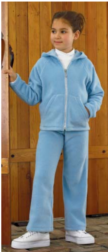
Girls' raglan sleeve shirts and pull-on pants. View A pullover shirt has round neckline with ribbing neckband and side hemline slits. View B shirt has zipper front, patch pockets and hood. Pants have slightly flared legs and elastic in casing at waist.