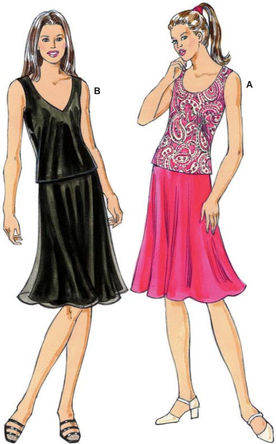
Misses' bias cut top and skirt. Lined pullover sleeveless tops have bust darts. View A has scoop neckline, View B has V-neckline. Pull-on flared skirt has narrow elastic in casing at waist. Skirt has optional lining.