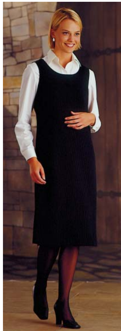
Misses' A-line, semi-fitted jumpers have bust darts and back zipper. Neckline and armholes are finished with self fabric facings. View A has round neckline, View B has V-neckline, View C has scoop neckline.