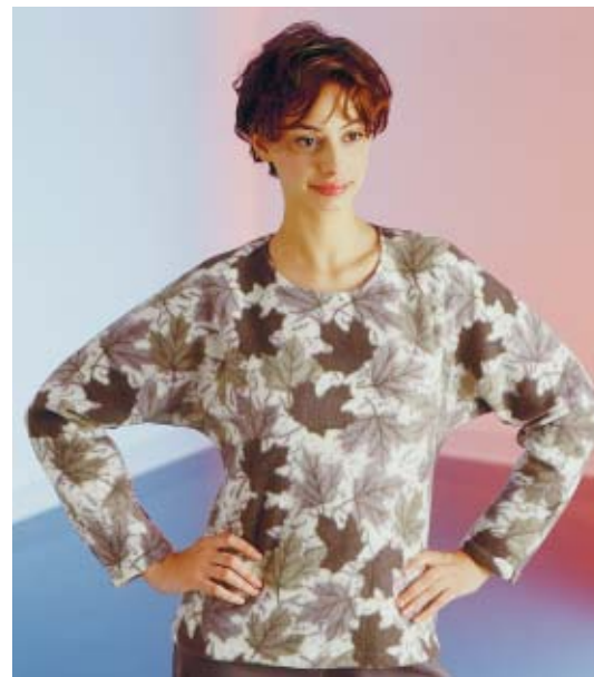
Misses' dolman sleeve pullover tops. View A has funnel neck. View B has hemmed boat neckline. View C has hemmed round neckline. Tops are cut with the grain of fabric around the body.