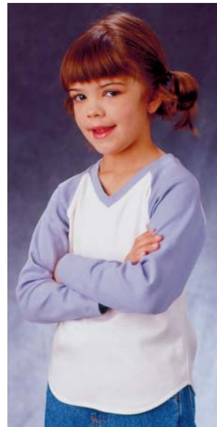
Girls' raglan sleeve shirts. View A has round neckline with neckband. View B has hood, patch pocket and short sleeves. View C has V-neckline, shirt-tail hemline and sleeves and neckband are from contrast fabric.