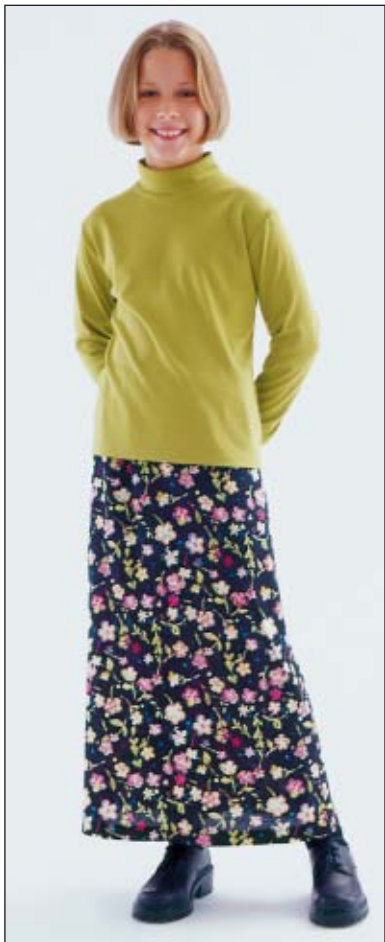
Girls' skirts and pullover tops. Top View A has mock turtleneck and full length sleeves. Top View B has boat neckline finished with narrow hem and three quarter length sleeves. A-line pull-on skirts have elastic waist with self fabric drawstring.