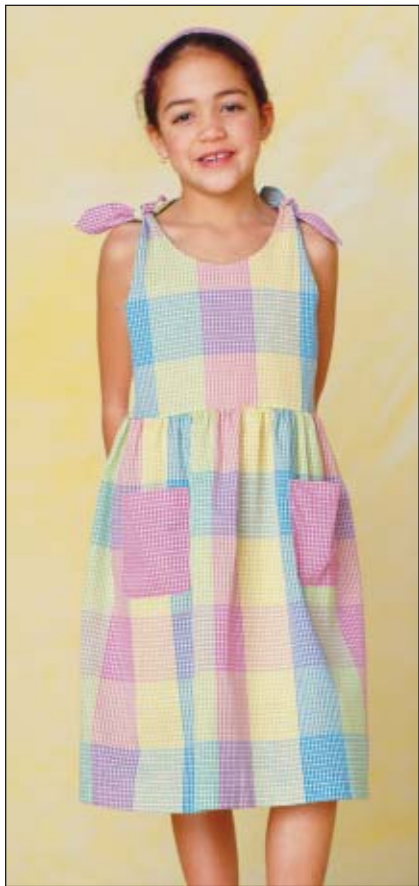
Girls' dresses have gathered skirt, patch pockets and double bodice. View A has scoop neckline, adjustable shoulder straps, button closure on back and elastics in casings on sides. View B has scoop neckline, ties at shoulders, inside bodice and pockets are from contrast fabric.