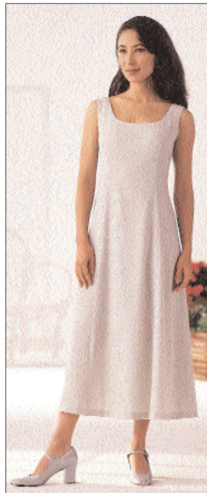
Misses' semi-fitted sleeveless princess line dresses have flared skirts and zipper at center back. View A has sweetheart neckline and self fabric bow. View B and C have scoop neckline.